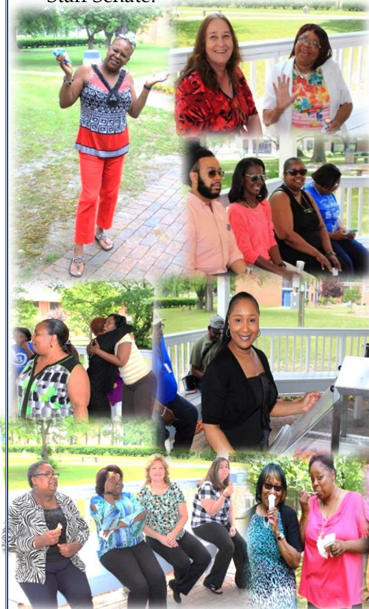
Ice Cream Social