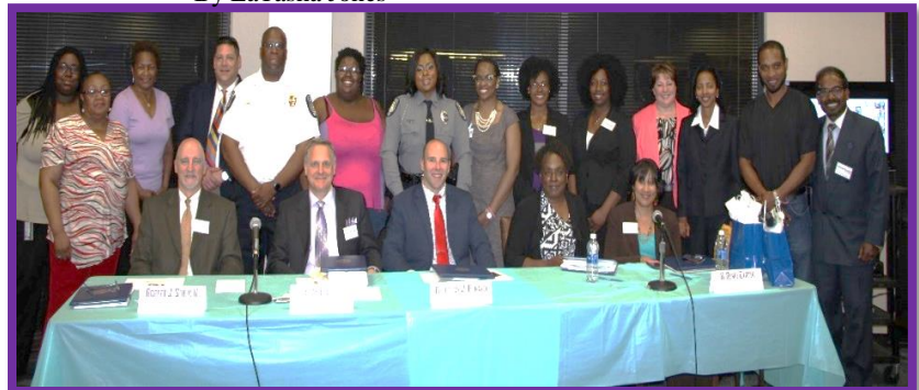
Partnering Together: Staff Senate & Campus Police