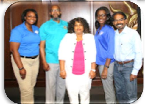
Staff Assembly Delegates