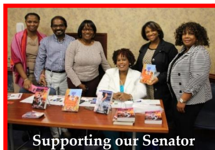
Supporting our Senator

Students, staff, faculty members and other guests came out in support of these authors. The students loved the participatory aspect of the event and were delighted with each speaker during the course of the week. Light refreshments were served after each presentation. It was a wonderful event.